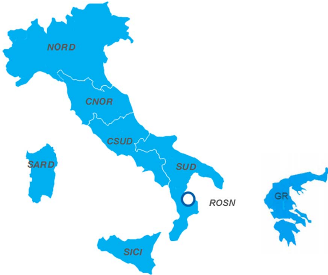
Map 2: GRIT CCR